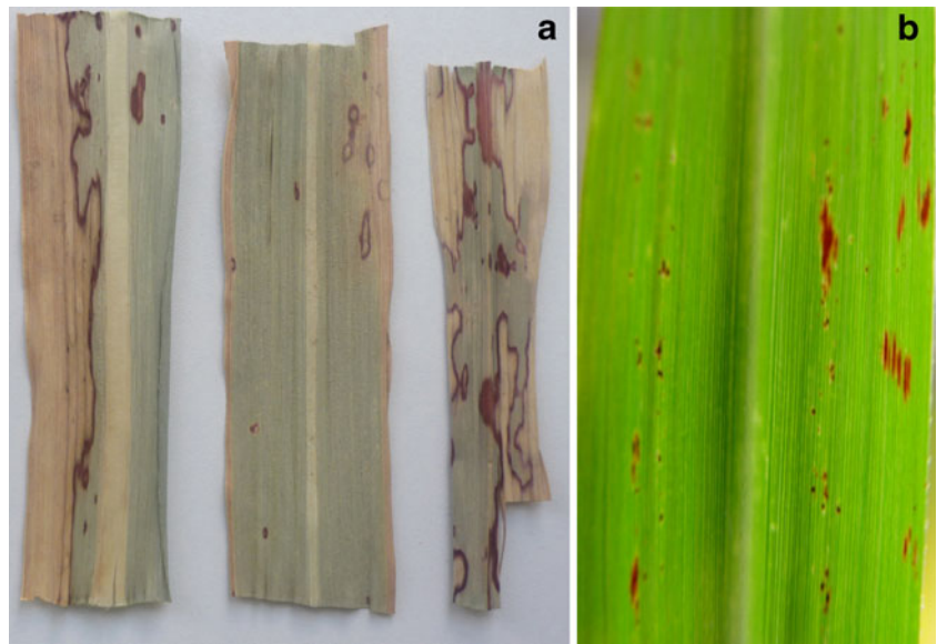
Fig. 1 Symptoms of leaf spot caused by Exseorohilum rostratum on sugarcane. a leaf spot symptoms on naturally infected sugarcane in field. b leaf spot symptoms on infected sugarcane under greenhouse conditions 3–4 days after inoculation

CBS 467.75 (GenBank accession HE664034). According to morphological and molecular analysis, the isolates were identified as E. rostratum .