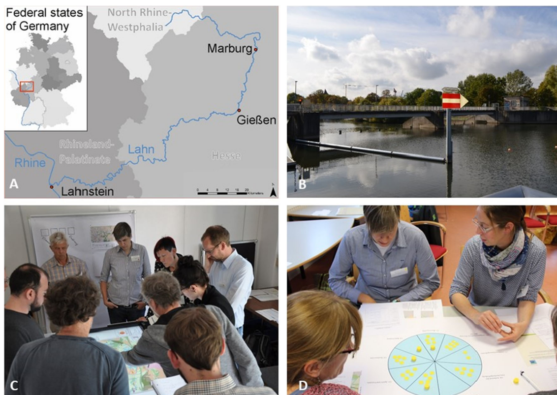
Fig. 2 Location of the Lahn River landscape (a), Lahn River and technical infrastructure (b), and impressions from the LahnLab Workshop Series, depicting a Geodesign-workshop using a touch table and spatial decision support tools (c) and a weighing task as part of a participatory multi-criteria analysis (d)

(county), state (Hesse and Rhineland-Palatinate), and national level.