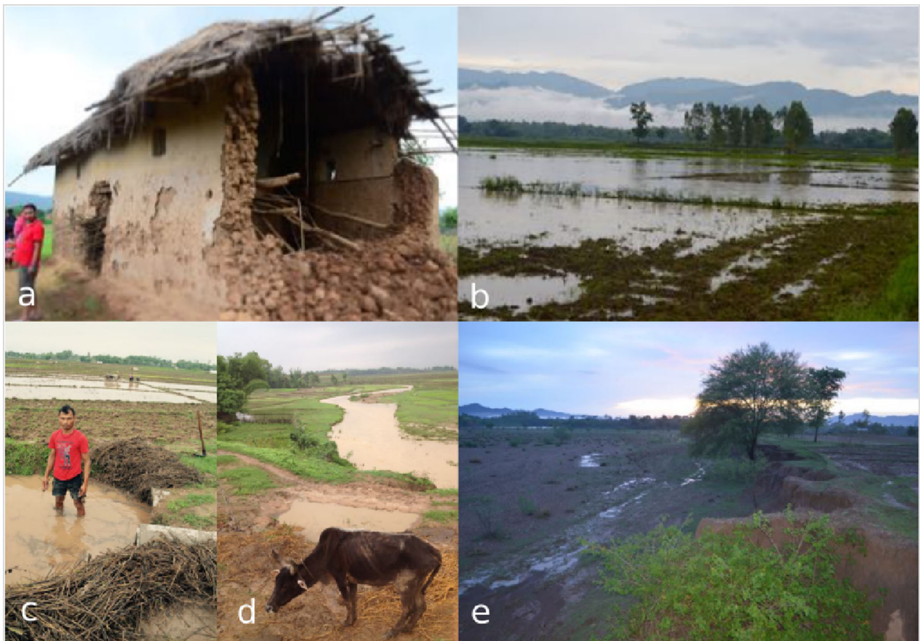
Fig. 3 Images illustrating infrastructural damage and crop sedimentation from heavy rainfall and flooding in the Terai Plains of Nepal (July/August, 2012). a Damage to a communal grain store that collapsed after heavy rainfall in Kunjiwar, Duruwa VDC, Dang Valley. b Rice fields covered in sediment adjacent to breached riverbanks of the Tinau River in Makrahar VDC, Rupandehi district. c Obstruction of irrigation canals from debris after flooding in Manikapur, Bijauri VDC, Dang. d During heavy rainfall, flooding erodes riverbanks and increases river channel depth. Here, river water covers fields where rice seedlings are cultivated, leaving the land unproductive, livestock drowned, and crops lost in Lamaai, Dang. The change in the profile of the river leads to downstream flooding. e Productive land washed away and hundreds of hectares abandoned when a tributary of the Bagaai River diverted its course in the Dang District

provide meat, milk, fertilizer, transportation, and power experience cardiac arrest, heat stress, and “drooling disease.” In both in hotter and wetter conditions, market price volatility increases, and farmers generally have to pay higher prices for inputs, thereby reducing profit margins.