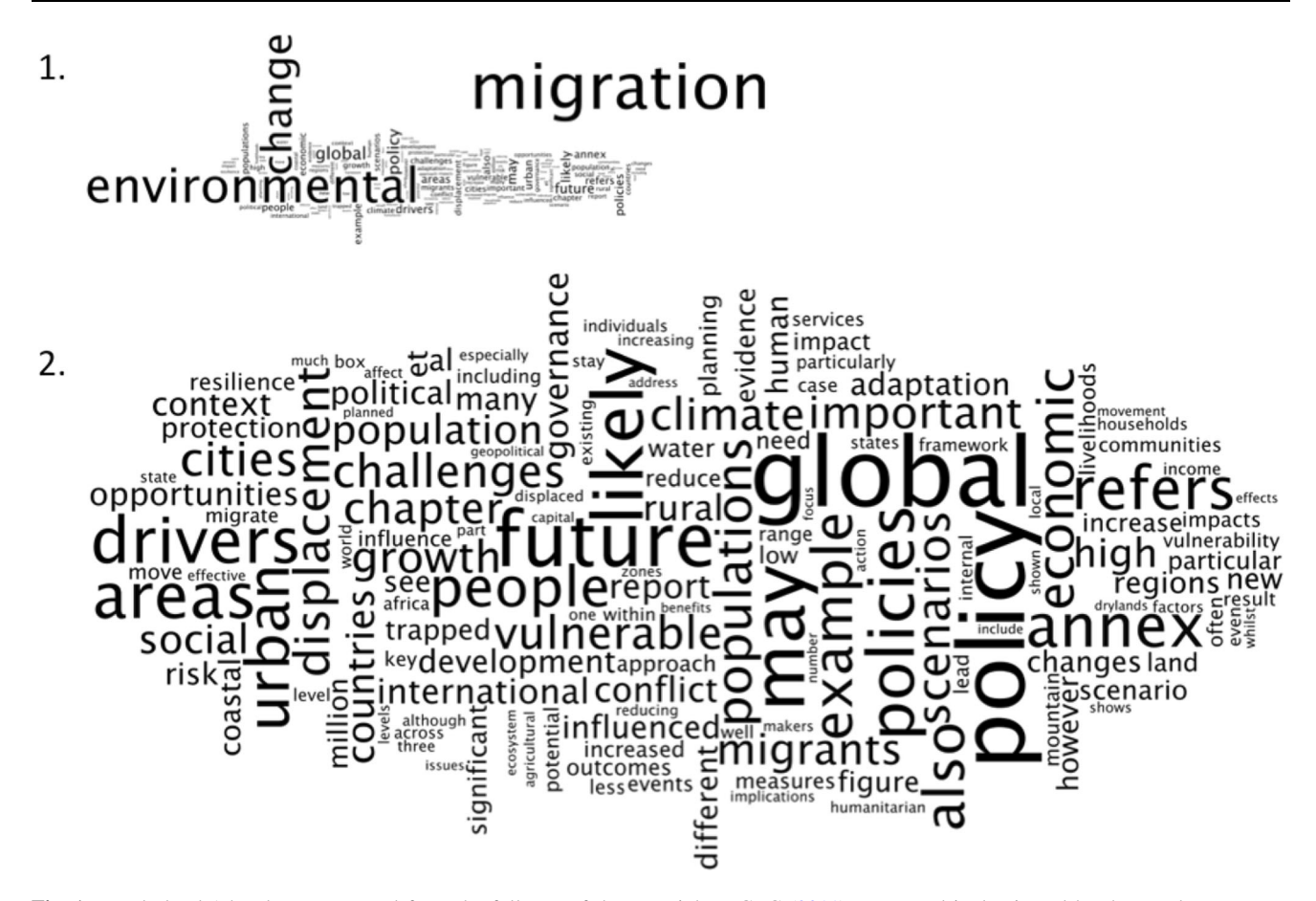
Fig. 1 Word cloud 1 has been generated from the full text of the Foresight MGEC (2011) report and is dominated by the words migration , environmental , and change . To enable more in-depth analysis, Word cloud 2 has been created using the same source text but is displayed with the words migration , environmental , and change removed. Larger font size of a word indicates greater prevalence within the text with non-conceptual words such as 'the', 'by', and 'for' removed