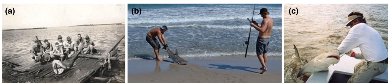
Fig. 1 Examples of the scale and scope of recreational fishing practices over time, evidenced by differences in practices, angling gear, context, and species types/age classes targeted: a historical recreational capture of a large tiger shark ( Galeocerdo cuvier ) captured with basic rod and reel off Haiti in the 1920's; b beach angling for medium to large coastal species ( a blacktip shark Carcharhinus limbatus is pictured); c coastal or offshore charter boat fishing for large coastal or pelagic species ( a lemon shark Negaprion brevirostris is pictured).

Here we provide a wide overview of recreational shark fishing, defined as the purposeful targeting and catching of sharks for non-commercial and non-artisanal purposes. We summarize the general history of shark recreational fisheries and the current status of fishing practices from a variety of regions and countries where these practices are most common (or where information was most available). We further examine the challenges the recreational fishing sector presents to conservation and management of sharks. We also present a series of research areas and questions to help guide future investigation of recreational shark fishing and offer a basic set of shark catch-and-release fishing guidelines (e.g., best practices) based on current research and employing a precautionary approach. While recreational fishing can generate a number of direct and indirect conservation benefits for sharks under certain circumstances similar to other forms of ecotourism (discussed in Cooke et al. 2014), our discourse focuses on the relatively