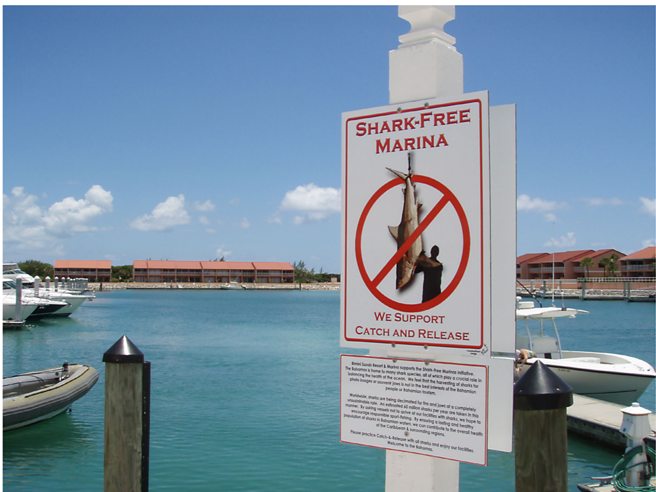
Fig. 2 Signage at a marina in the Bahamas depicting the ‘Shark-Free Marina’ initiative whereby marinas agree to prohibit the landing of recreationally caught sharks

A variety of techniques and gears are used in recreational shark fishing (Florida Museum of Natural History, Florida Sea Grant, NOAA Fisheries, Shiffman and Hammerschlag 2014; Gallagher et al. 2015; McClellan Press et al. 2015; Authors personal experience). For example, anglers targeting small sharks in nearshore tidal flats and reefs may use fly-rods or light tackle fishing from small skiffs, whereas trophy fishers may venture hundreds of kilometers offshore to target large pelagic sharks using heavy tackle in deep water and fishing from large charter boats (for more examples, see Fig. 1). Anglers also fish for sharks from shore (e.g., via surf casting), where sharks are usually brought on land prior to release. In the USA alone, more large sharks (i.e., non-dogfish) were landed by recreational anglers than commercial fishers in 2013 (Lowther and Liddel 2014; Shiffman 2014).