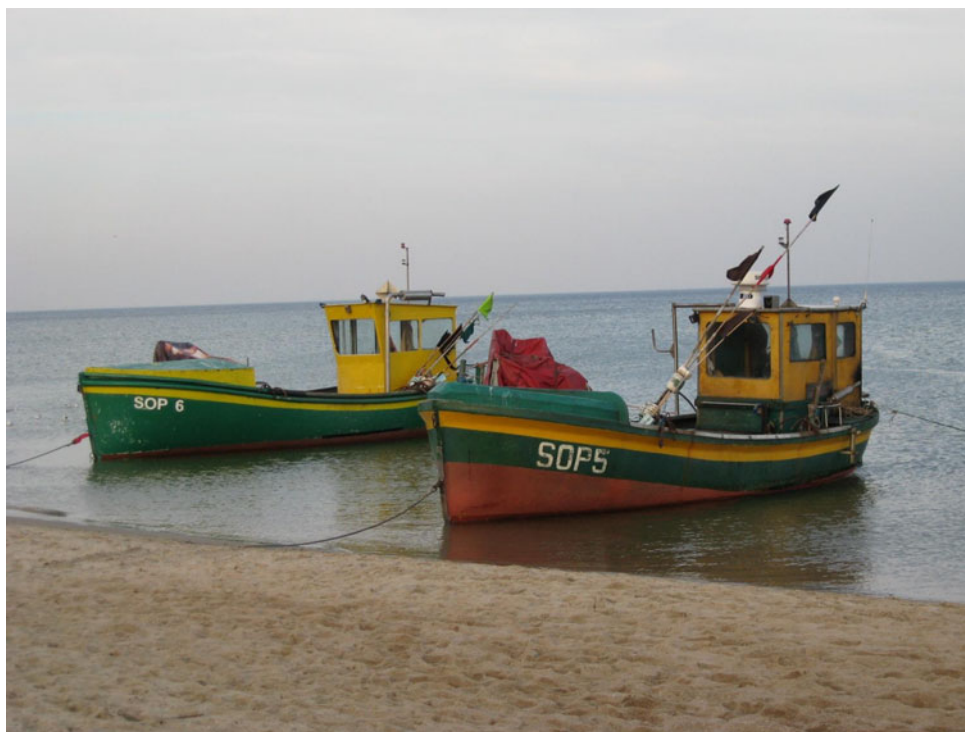
Fig. 1 Example of the fisheries being conducted on the Baltic Sea: fishing boats on the beach in Sopot (Poland).

lack of multi-annual management perspectives, fleet overcapacity and insufficient stakeholder involvement' (EC 2002a). The new CFP should be guided by the principles of 'good governance', including a 'broad involvement of stakeholders at all stages of the policy from conception to implementation' (EC 2002b).