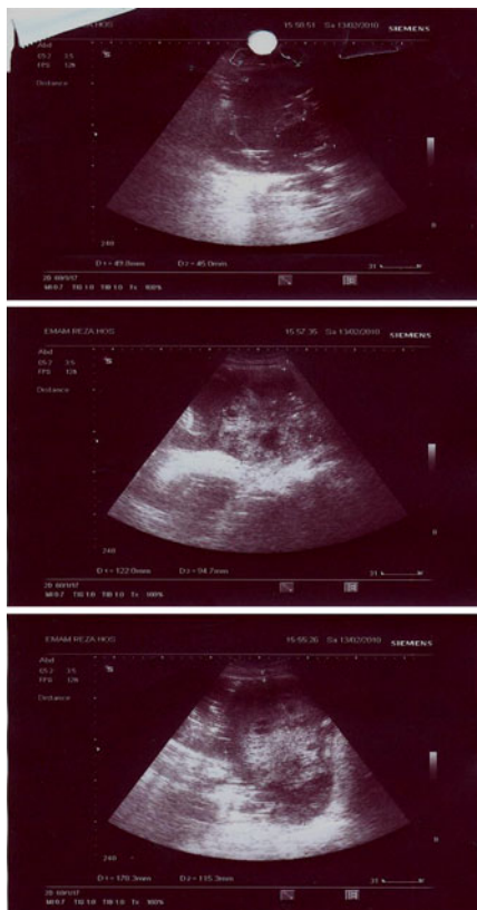
Fig. 1 Enlargement of ovaries and abdominal fluid despite therapy on the third day

surgery. The fever was resolved and appropriate urinary output was established. The lab tests on the fifth day after surgery are as follows: BS = 225; TSH = 11 \mu U/L; electrolytes, renal, and hepatic tests were normal. The abdominal fluid was aspirated under sonographic guidance. About 1 L of a serous liquid with some particles was extracted which was not purulent or foul-smelling. The preserved left ovary sustained its large size with numerous follicles and cysts, giving it the view of hyperstimulation. It appeared that the refractory hyperstimulation syndrome caused the recurrent abdominal distension through serous oozing from the surface of the preserved ovary. Dosage of metformin (TDS) and levothyroxin 50 \mu g daily was initiated. Two days later, the free fluid in abdomen decreased, and sonography reported the amount of abdominal fluid as moderate on day 10, and as minimal on day 15. Six months later the preserved left ovary was of normal size and had active follicles.