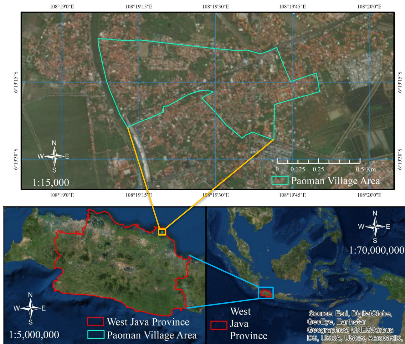
Fig. 1 Location of Paoman village, Indramayu district, West Java Province, Indonesia