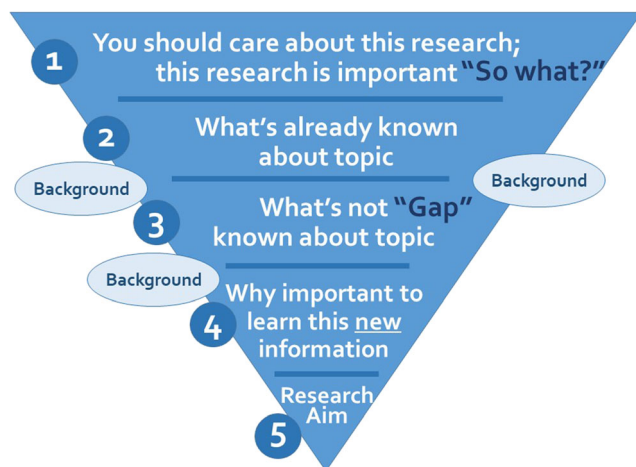
Fig. 1 The main elements of the introduction section of an original research article. Often, the elements overlap

errors in communication, we also suggest outlining more detailed roles, such as who will draft each section of the manuscript, write the abstract, submit the paper electronically, serve as corresponding author, and write the cover letter. It is best to formalize this agreement in writing after discussing it, circulating the document to the author team for approval. We suggest creating a title page on which all authors are listed in the agreed-upon order. It may be necessary to adjust authorship roles and order during the development of the paper. If a new author order is agreed upon, be sure to update the title page in the manuscript draft.