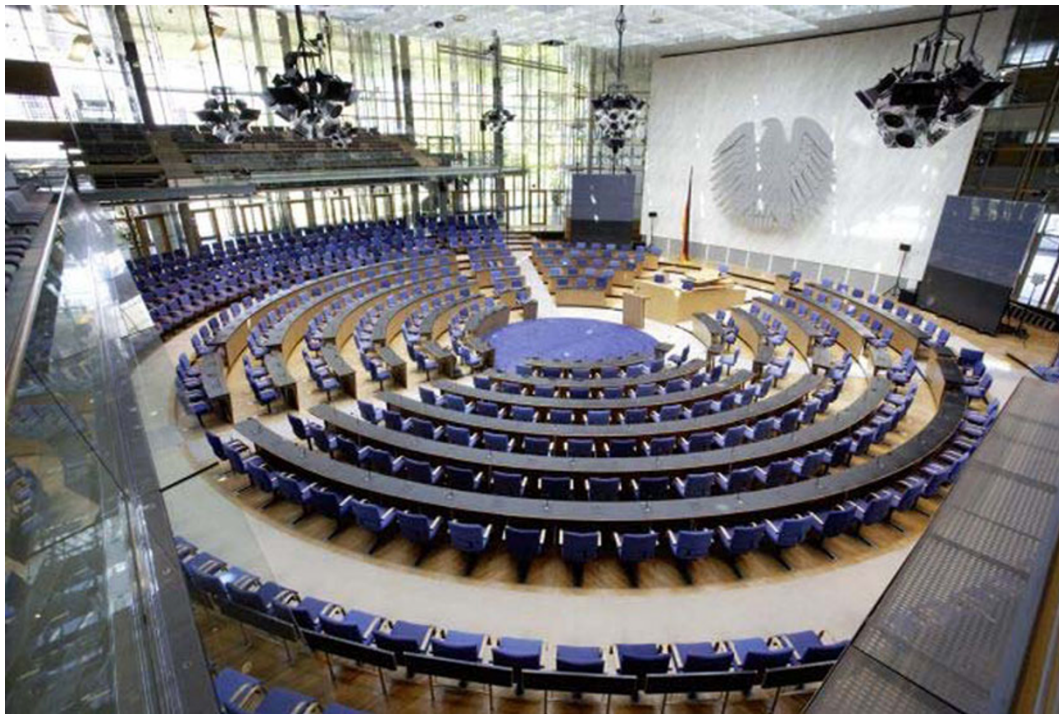
Congress venue: Former Parliament of Federal Republic of Germany – BUNDESTAG Platz der Vereinten Nationen 2, 53113 Bonn

congresses, on September 15th till 18th 2011, representatives and delegations from more than 40 countries worldwide are coming together in Bonn, Germany, in order to summarise current achievements, discuss problems, create future strategies and celebrate our consolidation in the innovative field of preventive, predictive and personalised medicine.