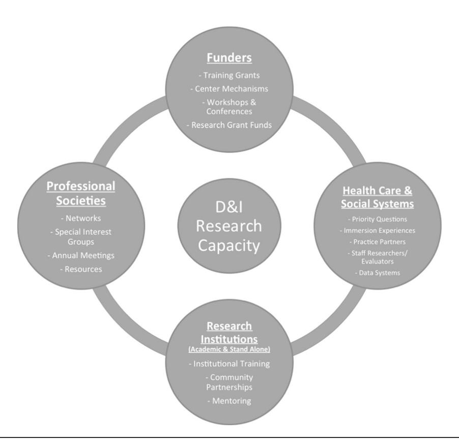
Fig 2 | Diagram of players in D&I research capacity building efforts. Research capacity is composed of healthcare and social systems, funders, research (both academic and stand-alone) institutions, and professional societies. Each of these entities interacts with one another and plays complementary roles in enhancing D&I research capacity

are essential if scientific discoveries are to improve delivery of health care.