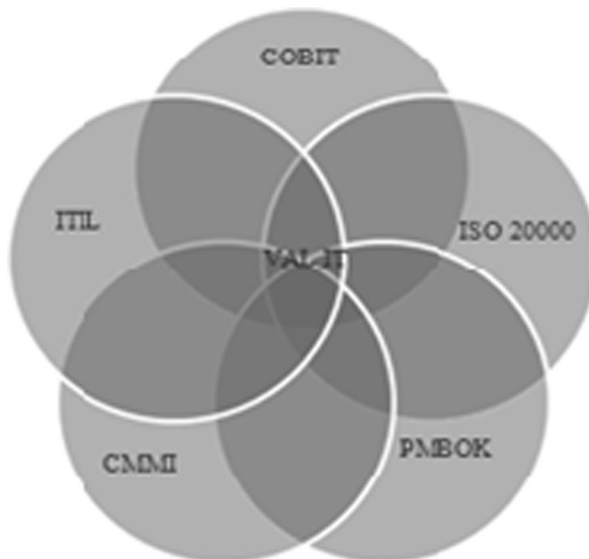
Fig. 1 The Val IT Framework: the emerging characteristics

The Val IT relies on a company governance perspective, helping executives to focus on two of the four vital questions related to IT governance. These questions are as