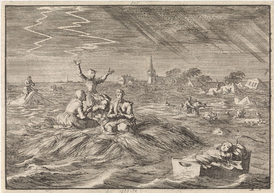
Fig. 1 Illustration by Jan Luyken of the flood in Groningen in 1686 with a baby in a cradle