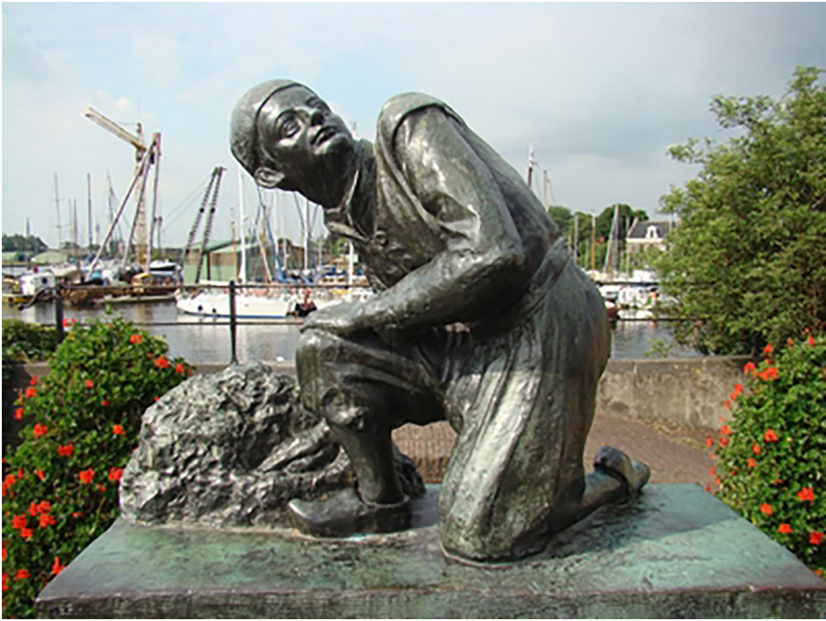
Fig. 5 Statue of Hansje Brinker in Spaarndam