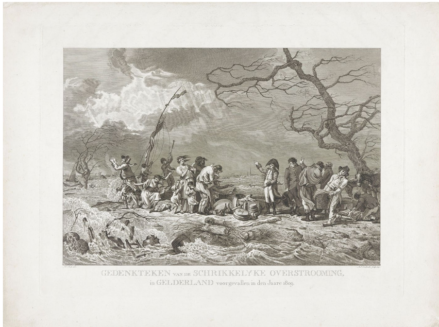
Fig. 2 King Louis Bonaparte visits the devastated areas in Gelderland in 1809, Rijksmuseum Amsterdam

and praying together, were constantly advocated, and generated social (and financial) solidarity (Duiveman 2019).