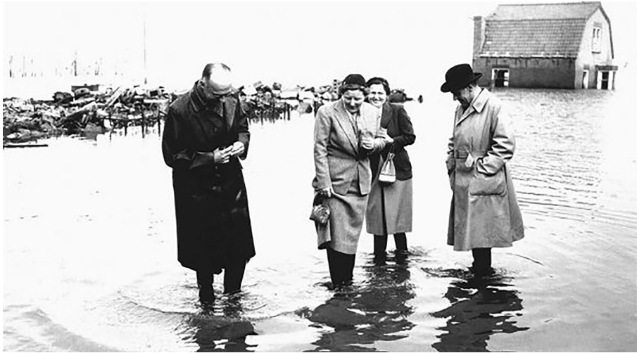
Fig. 4 Queen Juliana wading through the water after the Sea Flood of 1953

about representation: socialists criticized the media for painting a one-sided image of a king, who, according to them, had lost most of his political credibility (Fig. 4).