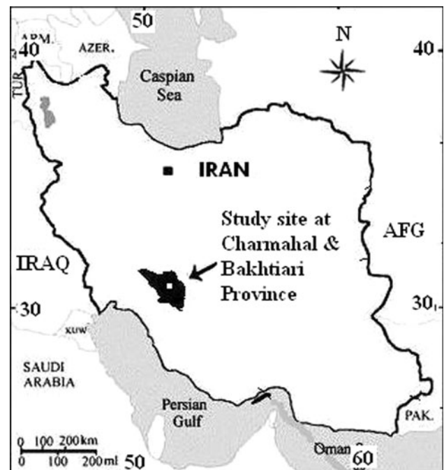
Fig. 1 Location of the study area in western Iran

After air drying, soil samples were sieved through 2-mm sieve for chemical and physical analyses. The MWD was determined using the wet-sieving method with the sieves set of 2.0, 1.0, 0.5, 0.25 and 0.1 mm (Angers and Mehuys