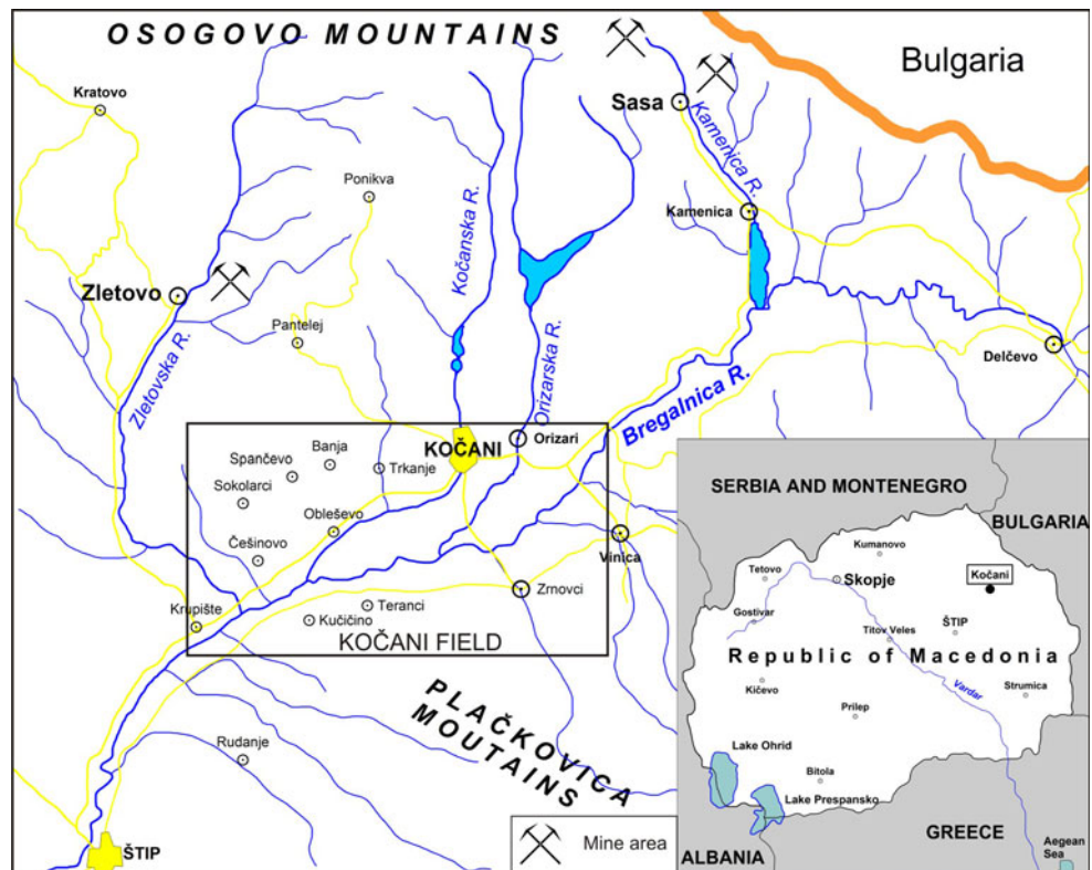
Fig. 1 Map of the study area, Kočani Field, Macedonia

and Sasa mines have caused an increase in heavy metal loads across the entire region and surrounding ecosystem (water, sediment, soil, biota, ...).