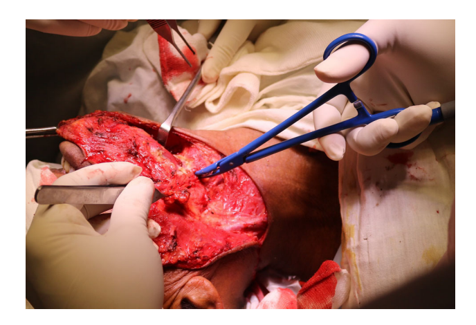
Fig. 1 Electrothermal bipolar vessel sealer

In Group I (n = 30), the EBVS was used for sealing the vessels or structures (up to 7 mm in diameter) as shown in Fig. 1. For thinner tissues or vessels, one seal was performed, and for larger vessels, the double seal technique was used. EBVS was first applied distally, closer to the structures to be removed, and then 3–4 mm proximally.