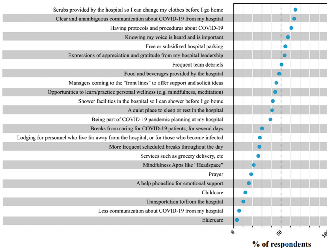
Fig. 4 Critical care workers perspectives on workplace strategies that would be helpful in coping during the COVID-19 pandemic

should include destigmatizing mental health issues and equitable access to professional counsellors.