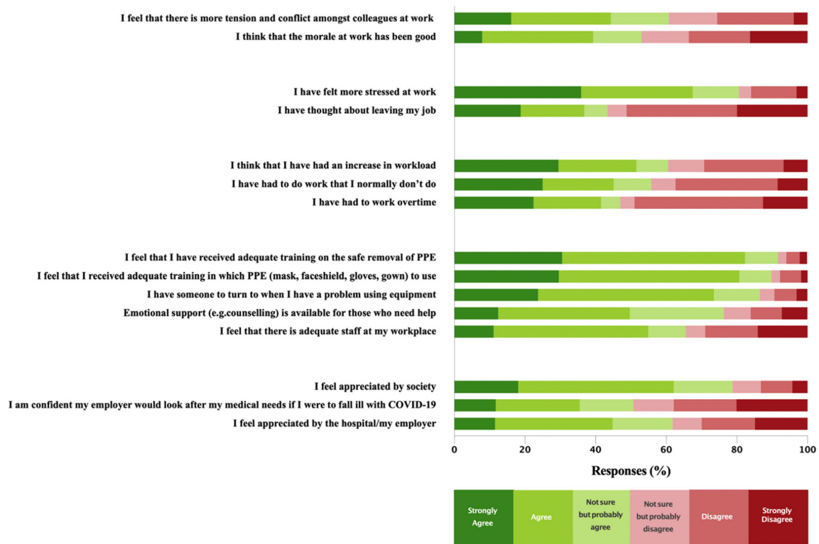
Fig. 2 Critical care workers' perceptions regarding work environment, workload, and personal protective equipment (PPE)