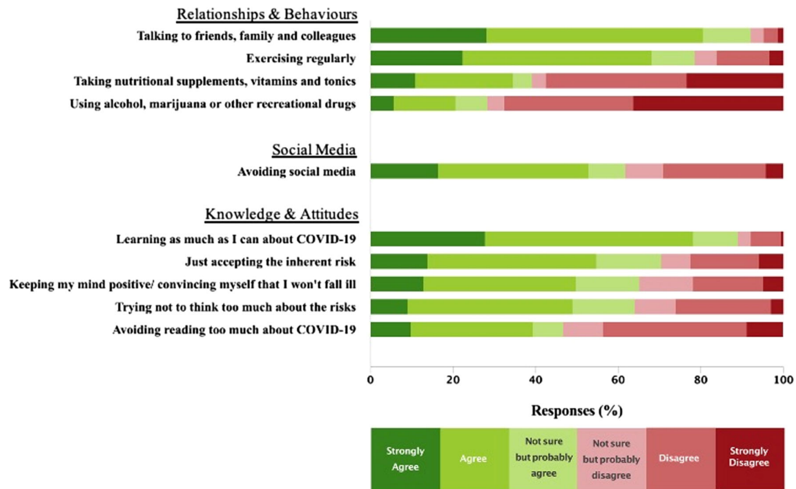
Fig. 3 Critical care workers' coping strategies related to the COVID-19 pandemic

need for healthcare organizations to build trust with workers. Underpinning principles of trust include effective and rapid communication, responsiveness to