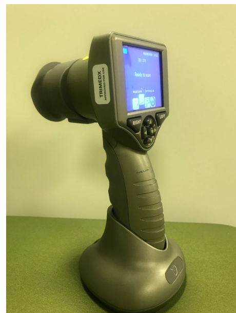
Fig. 1 The PLR-3000™ pupillometer (Neuroptics, Inc., Laguna Hills, CA, USA).

Articles for this review were identified from a search of PubMed and Google Scholar using the keywords of “pupillometry”, “pupillary reflex”, “pupillary response”,