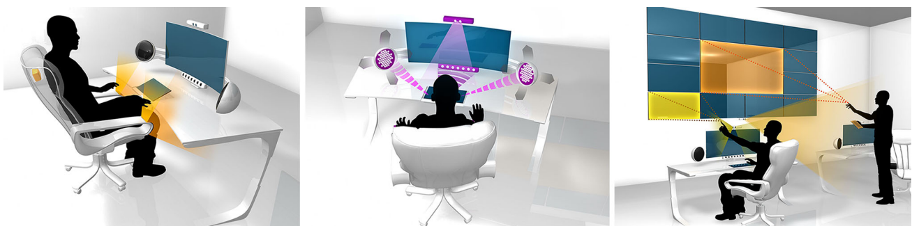
Fig. 2 Left: Comfortable sensor-equipped chair. Micro gestures allow for natural interaction during lengthy passive monitoring periods. Middle: Operators at workstations are tracked and an acoustic

The ROCKIT roadmap connects the strong research base with commercial and industrial activity and with policy makers. To develop the roadmap, and to make tangible links between research and innovation, a small