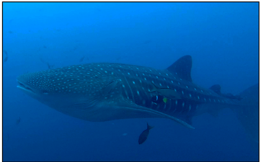
Fig. 3 An individual of Holacanthus passer cleaning Rhincodon typus in water column

which may be used as a baseline for the regional conservation. Moreover, we extend the variability of the feeding behavior of a few cleaner species from the TEP region and highlight the importance of studying pristine islands considered as hotspots of biodiversity. The TEP is an important biogeographical region, where limited information on its reef-associated fish structure and their biological interactions is available. In this sense, Malpelo Island deserves more studies focusing on describing the functioning of its reefs and developing methods for its local conservation.