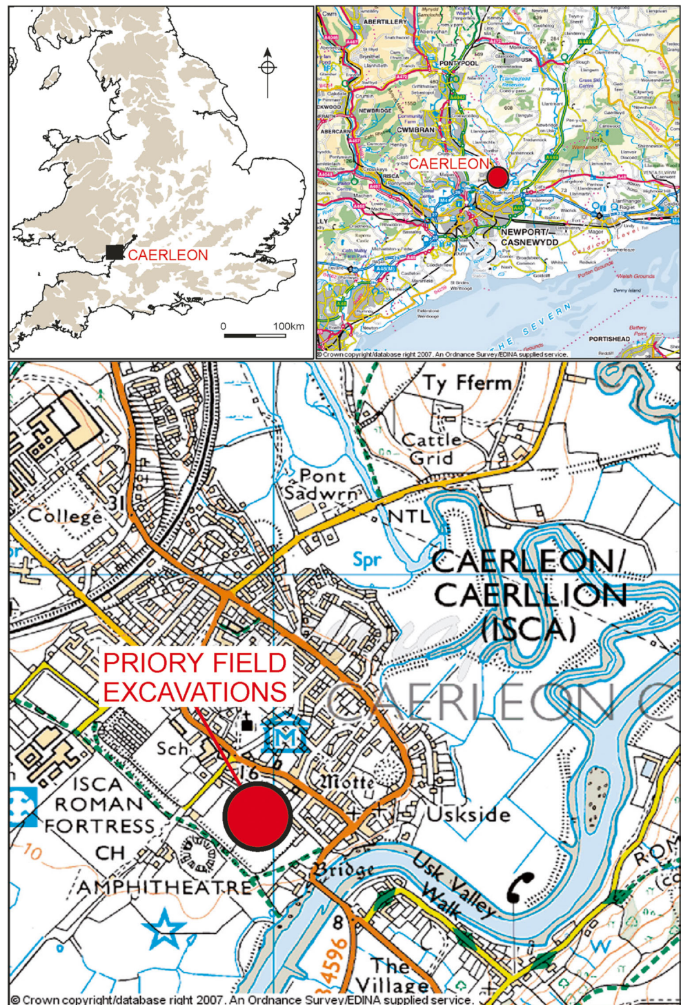
Fig. 1 Location map of Caerleon

some early developing teeth (M1 or dp4), enamel from closer to the root-enamel junction (REJ) was sampled, so that specimens did not represent radically different periods in the animals' lives. Where preservation allowed, the buccal surface of distal cusp units (in the case of molars) was sampled. Only teeth that showed wear were used, as these would be highly or fully mineralised and therefore more resistant to diagenetic