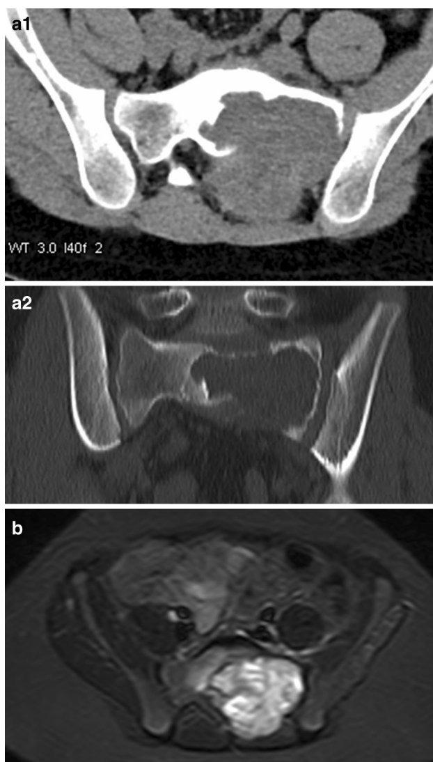
Fig. 1 Diagnostic imaging of patient 1. a1, a2 Initial computer tomography scan. b magnetic resonance tomography after 11 months of denosumab treatment

In October 2014, an 11-year-old boy was diagnosed with a solid variant of aneurysmatic bone cyst in the left os sacrum (Fig. 1a1, a2). The tumor caused intermittent pain in the left hip and leg. Surgical treatment was difficult owing to the localisation and extension of the tumor; therefore, off-label-use of denosumab was started in November 2014 at a dose of 60 mg on days 1, 8, 15, 28, and then once a month. When MRI and CT controls showed ossification of the lesion (Fig. 1b), denosumab treatment was gradually tapered by extending the interval between the doses from 4 to 8 weeks. Denosumab treatment was stopped after