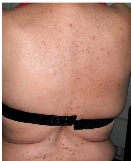
Fig. 2 Secondary cutaneous manifestations. Disseminated papules on the trunk

and can reach values such as 70:1 in other South American countries [18–22]. The occurrence of PCM in women is usually associated with juvenile clinical forms of the disease or the loss of hormonal protection in menopause. All cases in NEA were postmenopausal; no younger women with PCM were registered.