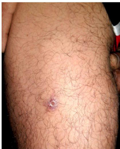
Fig. 3 Cutaneous localized lesion in the leg

In NEA, surveys with skin reactions in adults estimated infection rates ranging 10.9–20%. In contrast, only 1.6% of children and young people aged 2 to 14 years (average 10) showed previous contact with P. brasiliensis . The chronic adult clinical form has the most commonly been described in this area, and the juvenile form was always present in a very low percentage [23, 24]. Since only one case was informed in the last 15 years [25], hospital healthcare professionals from NEA had no experience in PCM in children. Despite this, from 2012, several cases in children with median of age 12 years old were reported. From severe disseminated