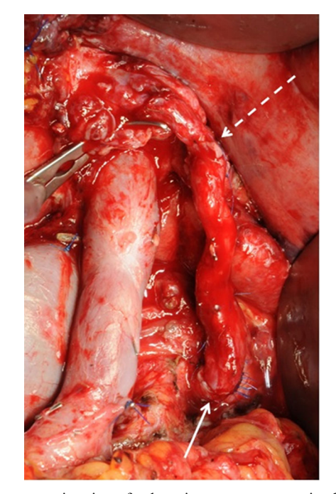
Fig. 3 Intraoperative situs after hepatic artery reconstruction by splenic artery interposition and total pancreatectomy, proximal anastomosis with the basis of the celiac axis ( white arrow ), and distal anastomosis with the proper hepatic artery ( broken white arrow )

Regarding resection of the SMA, only five studies were available, including a total number of less than 30 patients. All authors showed that the resection is technically possible, and grafting with the saphenous vein was the most commonly used method for reconstruction. However, morbidity of this approach is high and the oncological outcome is not yet convincing from the limited evidence.