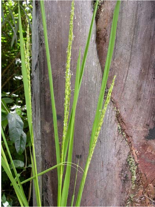
Fig. 4. Flowering stalk of Oryza glaberrima (MJ 70-75).

1990: 250). This legend tells how a Saramaccan hunter accidentally disturbed the garden of an extraordinarily powerful “apuku” forest spirit. It bears a remarkable resemblance to the story my Saramaccan informants told, independently from each other, on how their ancestors discovered Oryza glaberrima . The fact that the rice field was made by a spirit of the deep woods may have led to the name “mátu alísi” (forest rice) and the strong claim that the plant was growing wild before Saramaccans started to cultivate it. How this mysterious rice swamp ever came to be, which rice species ( O. glaberrima , O. rufipogon , or a hybrid?) was growing there, and whether it was related to the legend of the woman who hid the rice in her hair, we will probably never know. The importance, however, of Maroon oral history and ritual practices in the conservation of the different rice cultivars is evident.