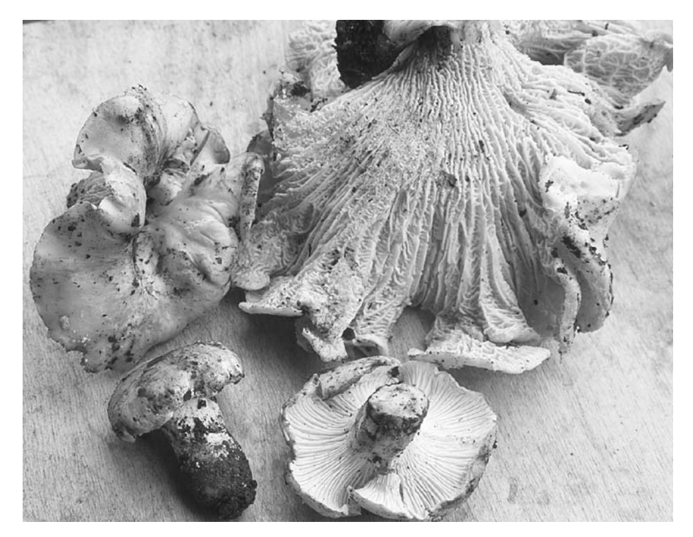
Fig. 3. C. californicus, young and mature specimens (Marin County, California).

C. formosus , in contrast, is large only under exceptional conditions; it rarely exceeds a half kilogram in weight and has a more highly developed gray-brown or dusky fibrillose pileal layer (see Redhead et al. 1997). Also, it typically has a slimmer, longer stipe and is associated with