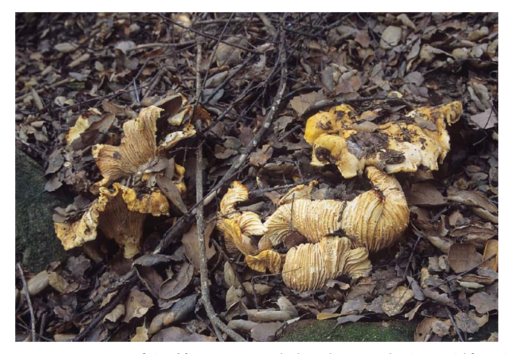
Fig. 5. Mature specimens of C. californicus growing under live oak, Los Angeles County, California. The tendency of the concave caps to lift up large quantities of soil and forest humus has given them the popular commercial name "mud chanterelles." (David Arora, all rights reserved).