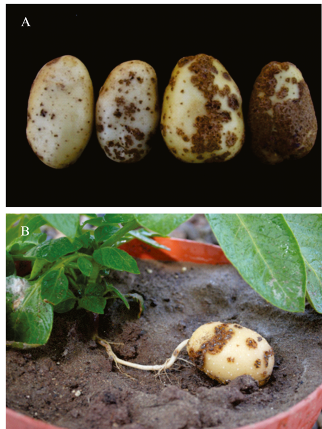
Fig. 1 Bacterial lesions caused by Streptomyces acidiscabies in potato tubers (var. Fianna). a Scab symptoms in potato tubers under field conditions. b Scab symptoms in a progeny potato tuber and stolon 7 weeks after seeding in artificially infested soil

The identification and taxonomy of Streptomyces spp. has been based on morphological and biochemical characteristics combined with thaxtomin production, as well as in vitro and in vivo pathogenicity tests (Faucher et al. 1995; Wanner 2004). However, DNA sequence relatedness, 16S ribosomal DNA (rDNA) sequences, and DNA-DNA hybridization have also been used successfully for species-level identification (Bouček-Mechiche et al. 2000; Healy and Lambert 1991; Kreuze et al. 1999; Lehtonen et al. 2004; Park et al. 2003; Song et al. 2004; Takeuchi et al. 1996). Thus, the sequence of the 16S rRNA gene in combination with the physiological,