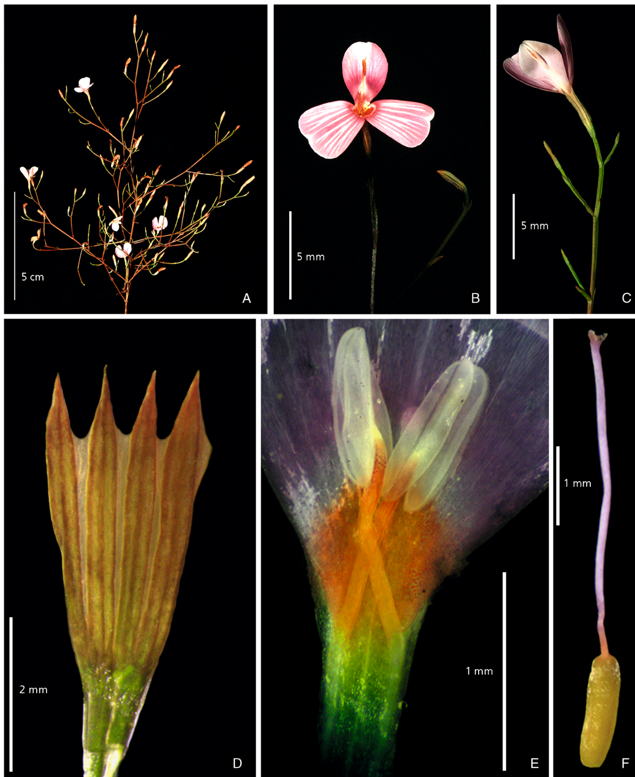
Fig. 2. Canscora shirangiana . A habit; B flower; C inflorescence; D calyx; E L.S. of flower; F carpel.

Herbarium); Amona, 12 Dec. 2015, S. S. Kambale & R. R. Kolte 220 (SUK).