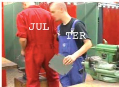
#2: TER leaves the anvil to JUL