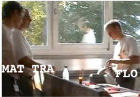
#1: FLO looks at the oil can used for tapping

In line 1, FLO implicitly asks the trainer (TRA) about the difference between the oil used for drilling and the oil used for tapping (“sir why don’t we use that for drilling”). In asking this question, he makes a connection between the activity he is currently conducting (the tapping) and an activity which he accomplished just before (the drilling). A local analogy thus begins to be woven between two close domains of reference. In line 2, TRA provides a first response to the question, by saying “because this one is made especially for that”. But for FLO this answer is not informative enough as shown by his reaction (“but what’s the difference”, l. 3). The trainer then elaborates a bit on his explanation (“well it’s not the same”, l. 4), and uses analogical discourse to build an explicit link between the tapping and the domain of car mechanics. He thus establishes a link between different kinds of oil used in general mechanics (lubricating oil for drilling vs. lubricating oil for tapping) and different kinds of oil used in car mechanics (motor oil vs. oil for the gearbox). He explains this relation by discussing a general property of oil: “it doesn’t have the same texture” (l. 8).