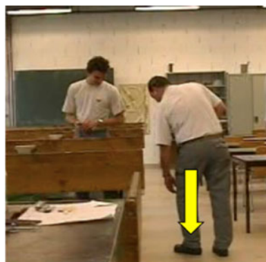
#2: TRA aligns his left knee to his foot

In this excerpt, it is again a specific body position that is being targeted by TRA's explanations. THI's position while filing the metal cube is seen as too stiff and this risks leading to an uneven surface of the metal piece. This false body position is both