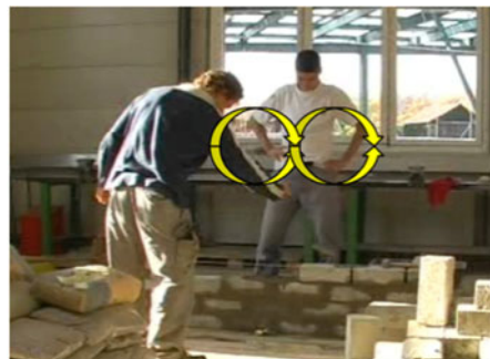
#2: TRA repeats the gesture with his right hand