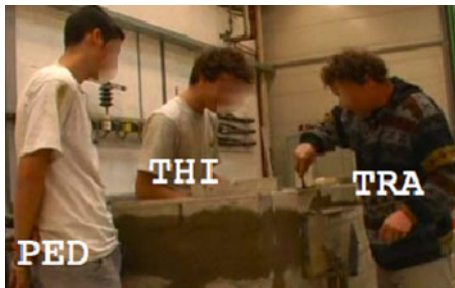
#1: TRA spreads cement with the trowel and shows THI how to work more quickly