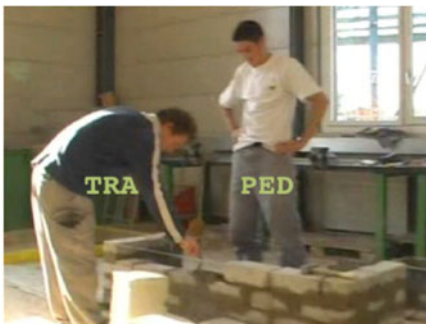
#1: TRA shows PED how to apply cement on bricks