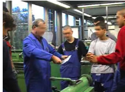
#2: TEA makes twisting movements with his hands