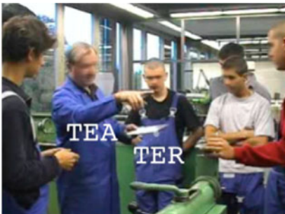
#1: TEA points the anvil and holds the iron sheet