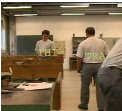
#1: TRA imitates THI's body position