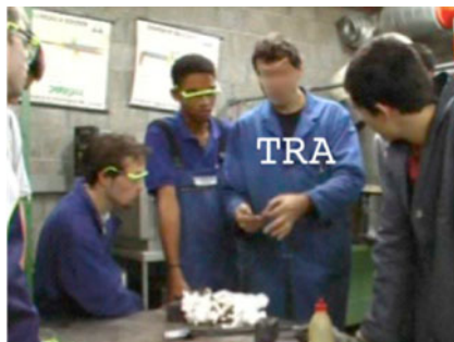
#1: TRA handles a piece of hardened steel

In this excerpt, the knowledge referred to by the trainer—the hardened steel —acts as the target referential domain: it is the chemical structure of this metal at that precise moment that is foregrounded in his explanation. The ice is used as a base or source referential domain: it belongs to an external conceptual field, imported to illustrate properties of the target. The notion of brittleness acts as a shared property between steel and ice before completion of the hardening process. It is that concept that acts as an analogical link between the imported source and the targeted knowledge.