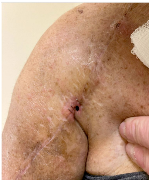
Fig. 1 Clinical photo of draining sinus tract after shoulder arthroplasty

The initial imaging modality in suspected prosthetic shoulder infection is plain radiographs (Fig. 2) to assess for any signs of implant loosening, bone erosion, osteolysis, and dislocation. Plain radiographs are not sensitive to infection for shoulder PJI, but it helps guide the surgeon to an accurate