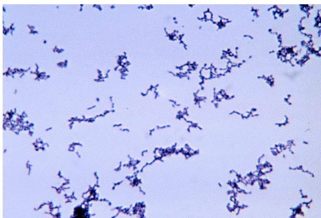
Fig. 1 Microscopic image of P. Acnes organism. Propionibacterium acnes by CDC- http://phil.cdc.gov ID#3083. Licensed under Public domain

The shoulder joint is prone to operative infection. Not only is it a synovial joint, with a nutrient-rich and immunologically diminished synovial fluid, but it also has close proximity to the axillary fossa, which is colonized by polymicrobial bacteria [13]. Surgical approaches to the shoulder near the axillary fold may increase the risk of infection with Staphylococcus aureus , Staphylococcus epidermidis , P. acnes , and Corynebacterium species [4, 5]. Patel et al. characterized the colonization of P. acnes in the flora of the shoulder (axilla),