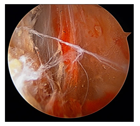
Fig. 1 Initial view of an inflammatory and thickened trochanteric bursa as initially visualized from the anterolateral portal with a 70^{\circ} arthroscope

access to the peritrochanteric space. Bursectomy is performed to allow for improved visualization, followed by inspection of the ITB and gluteal insertions [6, 22, 23]. A thorough bursectomy is complete when it extends to the insertion of the gluteus maximus and when the gluteus medius and minimus insertions are clearly visualized. This step is accomplished with a motorized shaver and a radiofrequency device to maintain hemostasis. Release of the posterior third of the ITB has been shown to be beneficial in cases where direct wear on the greater trochanter is seen or in patients with known recalcitrant external snapping hip symptoms [23]. Baker et al., in a prospective study of 25 patients who underwent arthroscopic bursectomy and were assessed at a mean follow-up of 26 months, showed significant improvement in Visual Analog Score (VAS; 7.2-3.1), Harris Hip Scores (HHS; 51-77), and short-form 36 scores from the preoperative status scores [22]. Variations on the endoscopic bursectomy have been described, including an ITB release either preceding [23] or subsequent to the bursectomy [25], with favorable results. Similarly, successful treatment of GTB secondary to gluteus medius and minimus calcific tendonitis has been described by Kandemir et al. [26].