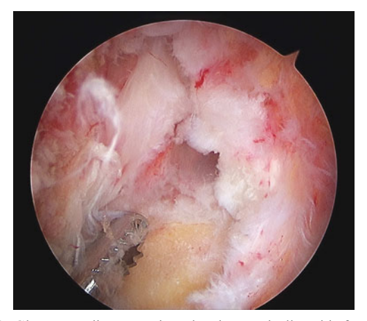
Fig. 2 Gluteus medius tear viewed arthroscopically with foot print prepared and tendon prepared for repair

during hip flexion [31–34]. This frictional irritation may also lead to GTB [31]. As with internal snapping hip, patients will describe a snapping sensation that occurs with exercise or routine activities; they will be able to localize their pain and recreate the snap. The Ober test may be positive with tightness of the ITB. Applying pressure over the greater trochanter as the patient flexes at the hip may prevent the snap [31, 35].