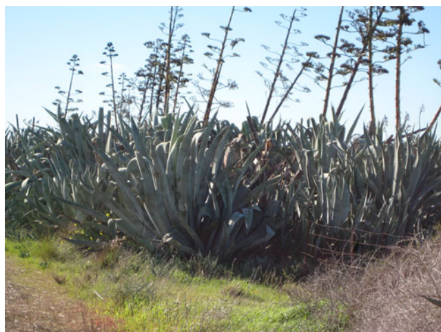
Fig. 2 Photograph taken at an experimental plantation of A. americana in Australia. The biggest agave individuals weighed 1.2 Mg (Arturo Velez, personal communication)

needed to get similar amounts of biomass with poplar (Table 1). Any bioenergy crop under similar amounts of rainfall would be very far from reaching the above-mentioned productivity of A. salmiana , and many of them would even struggle to survive.