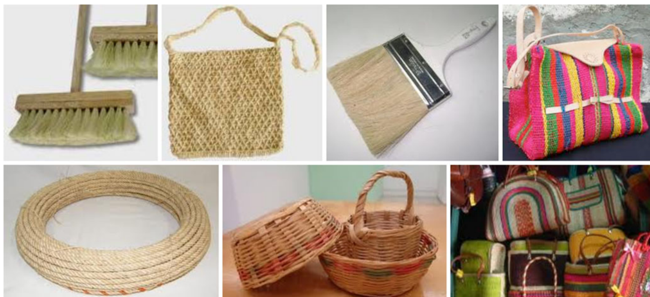
Fig. 3 Mostly artisanal products from Agave fibers (ixtle) now remain in the market

manipulating cell wall polymers [6, 16, 22], or enhancing specific valuable by-product levels.