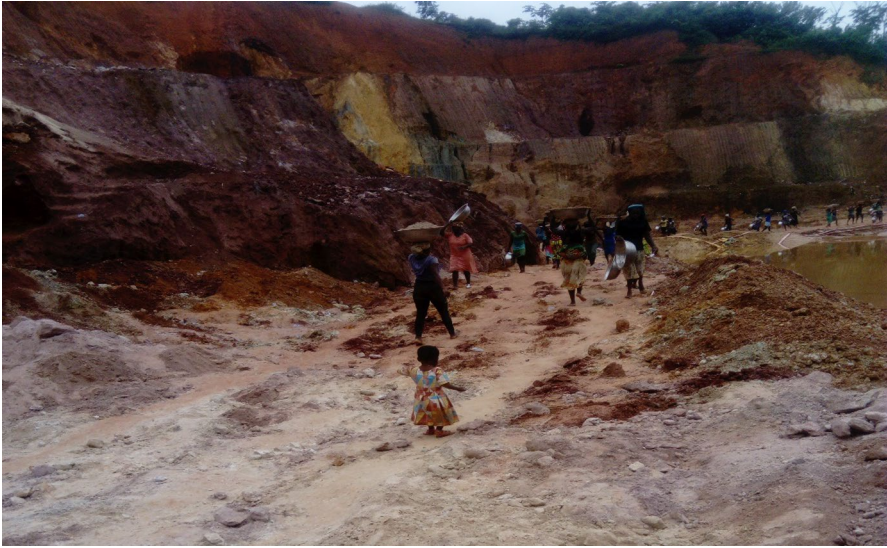
Fig. 4 A little girl following her mother while crying at a mining site

employ nannies at the site and build a proper structure for them to look after our kids (33-year migrant woman, Prestea).