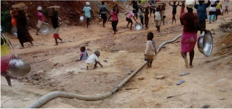
Fig. 3 Children left at the sites without any attention given to them