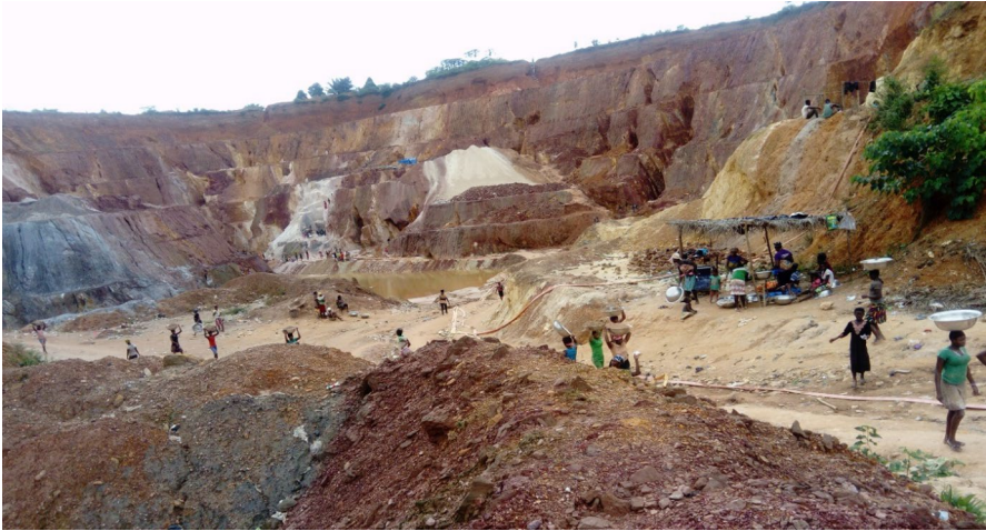
Fig. 2 Tent(s) used by vendors and self-proclaimed galamsey owners

at the expense of most of the women miners. This partly supports extant research in the ASM sector which highlights gender disparities in exposure to environmental and health hazards as important factors [3, 31]. As Armah et al. [3] assert, gender differences in exposure to risk factors and psychology as well as sex-related factors and varying social situations produce gender-specific occupational health problems.