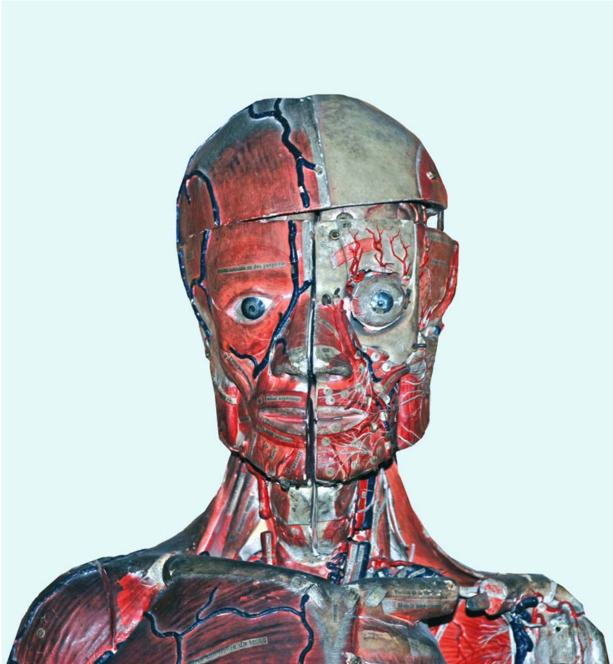
Figure 2. Clastic man (detail) by Auzoux.