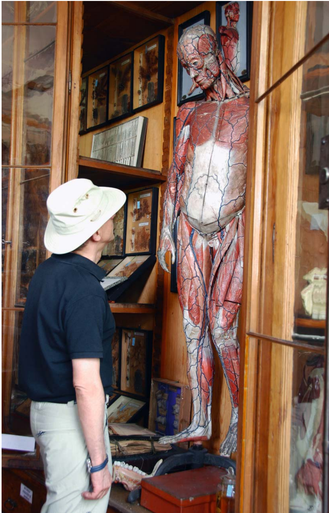
Figure 1. Clastic man by Auzoux.