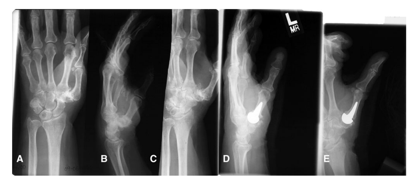
Fig. 2A-E Preoperative (A) posteroanterior, (B) lateral, and (C) oblique radiographs show the left hand and wrist of a 63-year-old woman with Eaton-Littler Stage III arthritis of the basal joint of the