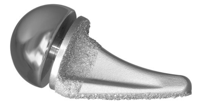
Fig. 1 A photograph shows the BioPro<sup>®</sup> Modular Thumb.

This report describes our results using this implant design. Our aims were to (1) assess pain relief and functional improvement and preservation of the appearance of the thumb as reflected by improved Buck-Gramcko scores [5]. (2) We also wished to radiographically assess the prosthetic reconstruction during followup and (3) document what complications occur with the use of this