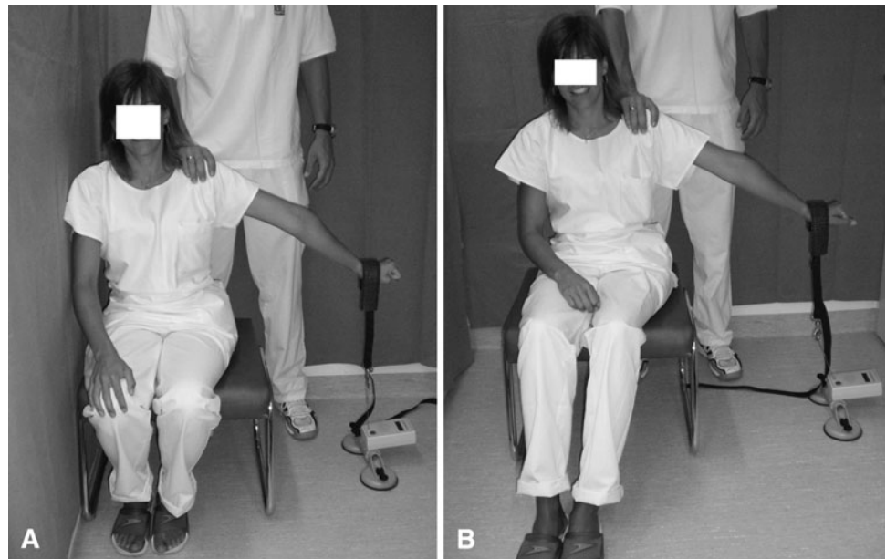
Fig. 1A–B The photographs illustrate strength measurement with the arm in 60° abduction with (A) a stabilized torso (by the wall) versus (B) a nonstabilized position.