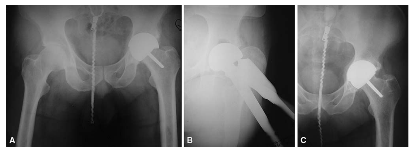
Fig. 1A–C Anteroposterior radiographs show the left hip of a 61year-old man who underwent resurfacing for osteoarthritis. ( A ) A routine radiograph in the recovery room showed his acetabular cup