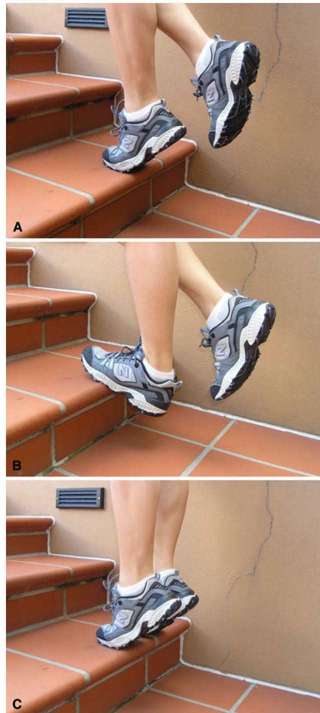
Fig. 1A–C An eccentric training protocol for the treatment of Achilles tendinopathy is demonstrated. (A) The patient starts in a single-leg standing position with the weight on the forefoot and the ankle in full plantar flexion. (B) The Achilles is then eccentrically loaded by slowly lowering the heel to a dorsiflexed position. (C) The patient then returns to the starting position using the arms or contralateral leg for assistance to avoid concentric loading of the involved Achilles tendon.

In addition to the data on eccentric strengthening, good results have been reported with a formal mobilization and