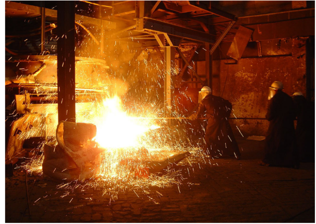
Fig. 2. Tapping the cauldron (pilot furnace) at Mintek (photograph by Geldenhuys, Mintek, 16 April 2004).

Scenario (c) illustrates a case where the pilot adjusts the direction regularly (comparing the actual progress relative to the destination) and over time a change in heading occurs. The aeroplane is not actually flying a “straight course”, but rather a funny curved path. At least the aeroplane will arrive at the desired destination, even if not completely efficiently. If drift occurs, the furnace