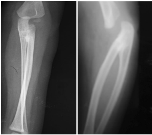
Fig. 1 Preoperative anteroposterior ( left ) and lateral ( right ) views showing the bone synostosis and the radial head posterior dislocation (Cleary and Omer type III)