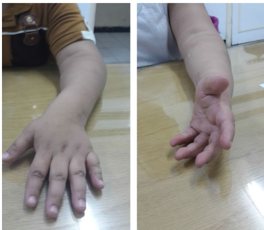
Fig. 3 Preoperative fixed pronation ( left ) and postoperative midprone position ( right )

head with the synostosis just distal to the proximal radial epiphysis [6, 8, 9]. A more recent classification by Cleary and Omer [2] described four radiographic types as shown in Table 1. The current study showed that Cleary and Omer classification has poor clinical relevance. In fact, no differences were found in functional results of surgery when comparing the two treated types [10].