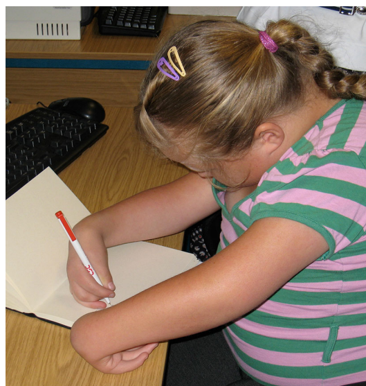
Fig. 5 Arthrogryposis multiplex involving the upper limbs