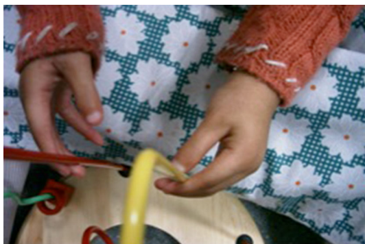
Fig. 3 Symphalangism