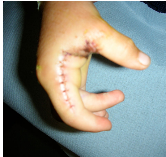
Fig. 6 Flap from radial index used to deepen the thumb web

In the proximal interphalangeal joints of the fingers, and metacarpophalangeal (MCP) joints of the thumb, further release of the volar plate can enhance the range of