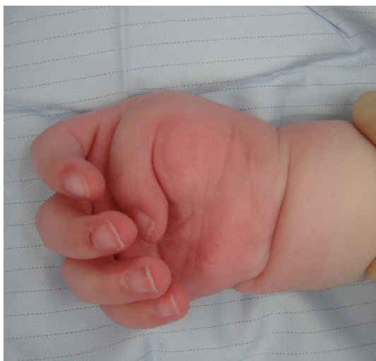
Fig. 2 Thumb in palm deformity