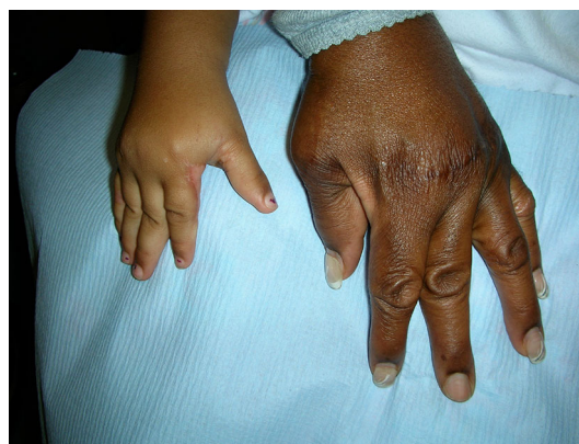
Fig. 4 Distal arthrogryposis in a mother and daughter; the mother had MCP realignment and the child had thumb web release

The priorities in assessing the upper limb in children with arthrogryposis include an examination of the shoulder, elbow and wrist as well as the thumb and fingers.