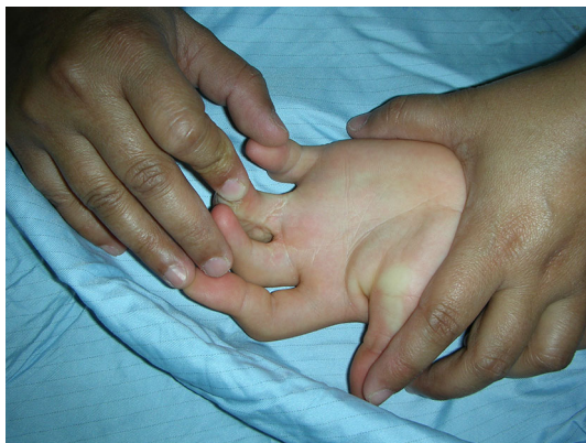
Fig. 1 Camptodactyly of the fingers