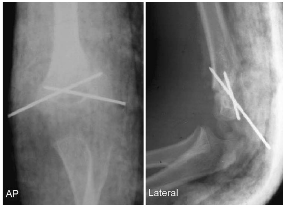
Fig. 4 Early post-operative anteroposterior and lateral radiographs after open reduction using a medial approach and cross-pinning

the electromyography examination to achieve correct diagnosis and follow-up. Pin-tract infection developed in 2 (6.5%) patients during the second post-operative week. These infections were resolved with a course of oral antibiotics and pin removal after adequate osseous healing. In 7 (22.5%) patients, a mean carrying angle loss of 12.4^\circ (range 6^\circ – 29^\circ ) was observed. None of the patients developed myositis ossificans or cubitus varus. At the final follow-up all patients had full range of motion of the affected elbow (Fig. 5). The radiographic examination revealed an average Baumann's angle of 76.8^\circ (range 71^\circ – 89^\circ ). Mean humero-ulnar angle was 4^\circ in males (range -5^\circ to 11^\circ ) and 6.8^\circ in females (range -10^\circ to 14^\circ ). Full functional recovery was obtained within 3 months in 29 (93.5%) patients (average elbow extension 0^\circ , flexion 140^\circ ) and within 5 months in the remaining 2 (6.5%) patients (average elbow extension 3^\circ , flexion 138^\circ ).