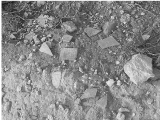
Figure 2. Broken Pottery in looters' back dirt pile, Modi'in.

On New Year's Day 2005 in the company of three other archaeologists, I travelled to the area of the reported looting to investigate the situation. We hiked up to the site and found evidence of looting in the form of spoil heaps (see Figure 2), discarded broken artefacts, dislodged tomb blocks and all of the paraphernalia associated with looting: