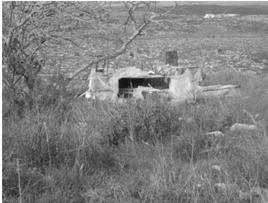
Figure 3. Make-shift homes of Palestinian construction workers.

agitated by our presence. The Palestinians kept watch of us from a close distance, but none seemed interested in answering the prying questions of a graduate student. We took notes, coordinates, digital images, and recorded as much of the area as possible and then left the area. Upon returning to Jerusalem one of the archaeologists informed the IAA anti-theft unit of the looting.