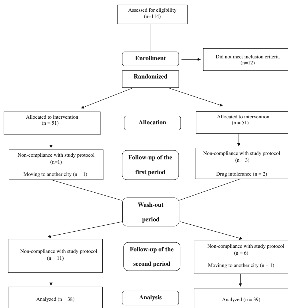
Fig. 1 Flow chart of the trial

FBS was not significantly affected by simvastatin nor by the placebo ( P > 0.05 ). However, mean baseline values for BMI and weight were significantly different between the first and second periods of treatment ( P = 0.019 and P = 0.003 , respectively) (Table 1).