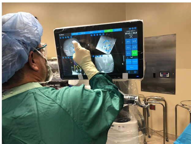
Fig. 1 Screw planning with the robotic positioning system

In intraoperative CT mode, the image coordinate system was obtained from a portable intraoperative CT (e.g., O-arm, Medtronic SNT, Louisville, CO, USA) or standard CT scan was taken at the time of surgery, with the patient already in position on the OR table. Spinal levels were identified and a CT scan was taken. Pedicle screw trajectories were planned and saved.