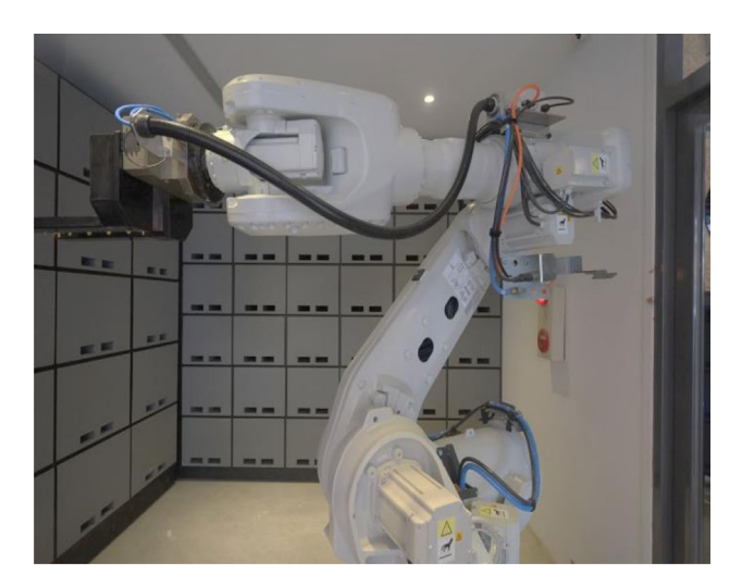
Fig. 3 A robotic arm to deposit luggage in the Chase Walker Hotel

of different service features) and actual performance (satisfaction after the experience) of service robots. To increase data collection, we provided an incentive to participants (encouraged them to list their e-mail addresses in each questionnaire to participate in a drawing to win several electronic products). This device (having participants provided their emails in both questionnaires) allowed us to match the two questionnaires for each responding guest and examine the gap (expectation vs. actual) on the service quality of robots.