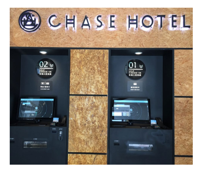
Fig. 2 An automation check-in system in the Chase Walker Hotel

The data for this study was collected through questionnaires given to guests of Chase Walker Hotel who used the robotic service. Guests were given two questionnaires with the same questions but at two different times for different reasons (therefore, questions were formulated as such): the first questionnaire was given to guests before they entered the hotel (thus, before they used robot services) and questions were about customers' expectations of the hotel's robotic services. The second questionnaire was given to guests after their stay in the hotel (thus, after they used robot services) but this time questions (same questions as the first time) were about their evaluation of the actual performance (satisfaction with their service experience) of service robots. Then the first and second part of the questionnaire for each guest were matched to examine the differences between expectations (importance