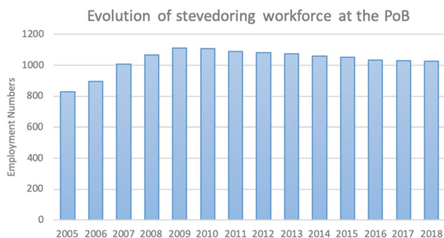
Fig. 5 Dockworkers employment data at the PoB for the last decade shows a slow but steady decline, which does not correlate with traffic levels. Source: Organización Estibadores Portuarios de Barcelona—OEPB (Data obtained by Barcelona Port Dockworkers Organization—OEPB from Estibarna, Barcelona’s management company of port workers (SAGEP))