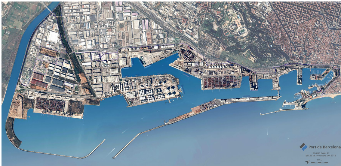
Fig. 2 Aerial view of the Port of Barcelona.

in facilitating capital's access to cheap pools of labor and resources (Islam et al. 2019; Liu 2013).