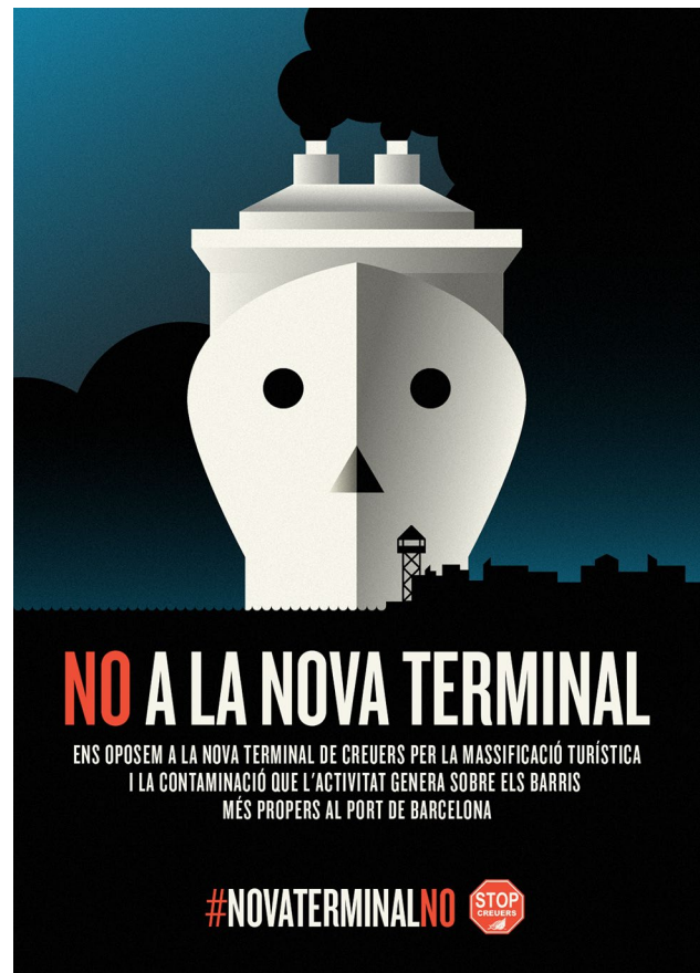
Fig. 4 Poster of a 2017 campaign launched by neighborhood organizations and environmental NGOs against the construction of a new cruise terminal at the PoB. It reads “No to the new terminal. We oppose the new cruise terminal because of the widespread growth of tourism and pollution that cruise activity generates for the neighborhoods closest to the PoB”.

The PoB significantly contributes to the atmospheric pollution of Barcelona’s urban area, of which road traffic is the primary source (Pérez et al. 2016). According to an air quality report from Barcelona City Council (2015), based on the data from the metropolitan network of air quality monitoring stations, the Port was the primary source of NO x (5.548,8 t) and PM 10 (505,6 t) in 2013, accounting for 46% and 52% of total emissions, respectively, while Pérez et al. (2016) found the PoB to be the only major source of SO 2 in the city. Virtually all of these emissions originate from ships berthing at the harbour, and estimations on their contribution to the urban area’s pollution are much lower and vary depending on the proximity to the harbor. On average, the PoB’s contribution to urban NO x pollution is estimated at 7.5% while at