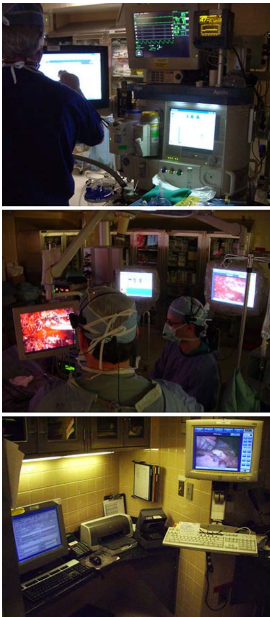
Fig. 1 Example of the myriad data sources incorporated by the anesthetist ( top ), surgeon ( middle ) and nurse ( bottom ) to synthesize their view of the patient and the state of the operation. Note the multiple displays, and that most are positioned so that they are only readily visible to a few individuals

Typically, the hospital information systems, monitoring systems and treatment delivery systems in the OR do not communicate with each other. Consequently, fragmentation of data divides the team's attention among multiple displays, as evidenced in Fig. 1. Here, the anesthesiologists, surgeons and nurses interact with many separate displays, each attached to its own individual computer, to provide physiologic monitoring, automated anesthesia record keeping, drug infusion, patient warming, hospital information system access, order entry, drug/supply chain management, surgical