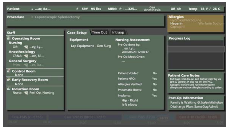
Fig. 6 Screen capture of the second dynamic pane (the “timeout” pane). Patient and staff identities have been concealed in this figure. Note that the procedure has now also been confirmed by the OR team and the font has automatically changed from gray to white

Fig. 5 Screen capture of the integrated information display. The integrated OR data display consists of a group of persistent panes around the perimeter and dynamically advancing panes arranged by tabs (Case Setup, Time Out and Intraop) in the center. This figure highlights the contents of the “Case Setup” dynamic pane. Patient and staff identities have been concealed in this figure. Note the white text for the confirmed patient name and the gray text for the unconfirmed procedure