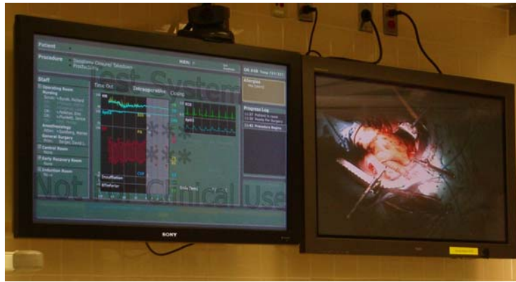
Fig. 4 The integrated OR data display resides directly adjacent to the surgical display. The close proximity of two large displays mandated that the design avoid detracting from the pre-existing surgical display, which is often in use during cases. The surgical display provides the entire OR team with an overview of the surgical situation. The OR data integration system is designed to provide a similar overview for key

patient perioperative data, including patient and staff identity, the procedure being performed and high-level physiologic trends. Thus, the system required adequate font size and graphical resolution to be visible and legible to anyone in the room, requiring the use of a large 42" LCD display. Patient identifiers normally present on the display have been removed from this illustration