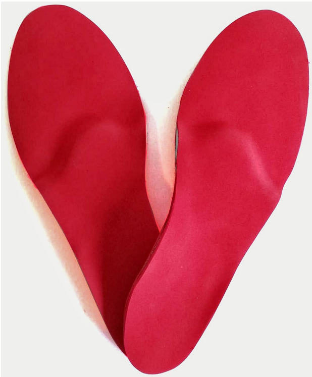
Fig. 1 The orthotics were made placing on an expanded ethylene vinyl acetate material a retrocapped latex bar at the level of the metatarsal heads and a polypropylene support of the longitudinal medial vault

the ultrasound examinations, patients were laying supine on the examination bed with the ankle relaxed. A dorsal approach was performed to identify pathological effusion in the metatarso-phalangeal joints. As a small amount of metatarsophalangeal joint effusion is physiologic, we considered this finding pathologic when an increase in intra-articular fluid was observed in at least one metatarsophalangeal joint when compared with the other ipsilateral and contralateral ones. A plantar approach was used to detect the presence of: intermetatarsal bursitis as a hypo to anechoic fluid collection in the intermetatarsal space, indeed, intermetatarsal bursa is not visible with ultrasound in normal conditions [27]; adventitious submetatarsal bursitis as a compressible hypo to anechoic fluid collection beneath the metatarsal heads [28]; MN as a round or peanut-shaped hypoechoic nodule placed in the plantar aspect of the intermetatarsal space being more visible squeezing the metatarsals during the scan [29]; flexor tendinitis as thickening/thinning of flexor tendons and flexor tenosynovitis as increased fluid content within tendons sheath [30]; oedema of the anterior plantar fat pad that has been scarcely reported in literature, although in our experience is frequently encountered in patients with metatarsalgia. As mentioned, the evaluation of the intermetatarsal spaces